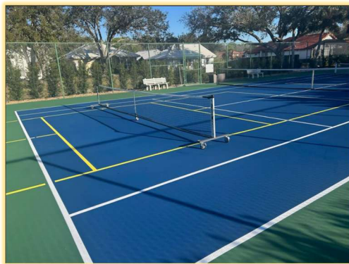
Resurfaced Tennis/Pickleball Court